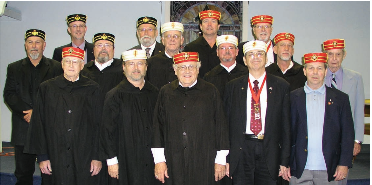
The Brothers of the Sarasota Scottish Rite Club performed The Ceremony of Remembrance and Renewal at the Sarasota Scottish Rite Temple on April 6 to a full crowd.