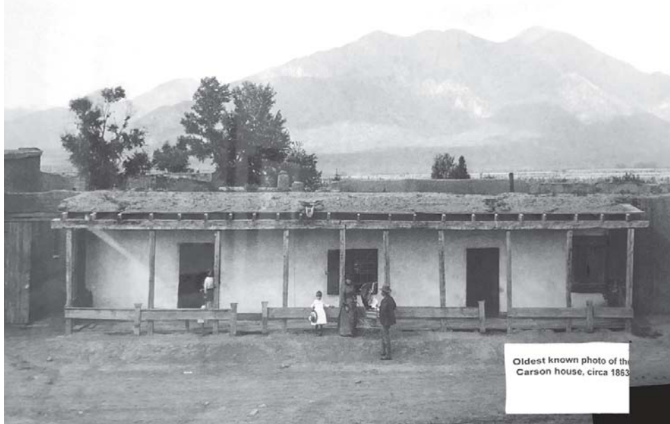
Oldest known photo of the Carson home, circa 1868.

Degree, Chief of the Tabernacle, will be conferred at 6:00 p.m. before the regular meeting. The Spring Reunion has been rescheduled for March 19, 2022—only the five mandatory degrees will be conferred. 🇺🇸