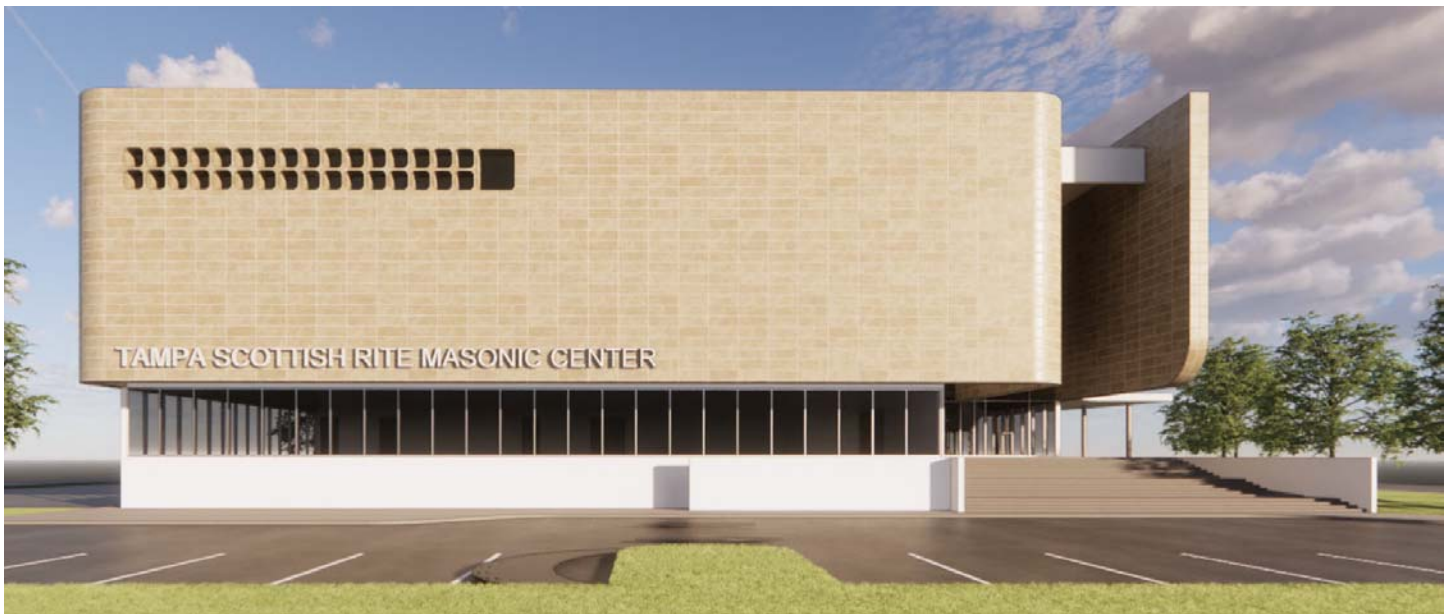
Initial Rendering of new Facility by WJ Architects – Schematic Design (subject to change)